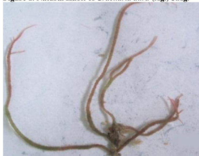
Figure 1. Natural Habit of Gracilaria dura (Ag.) J.Ag.